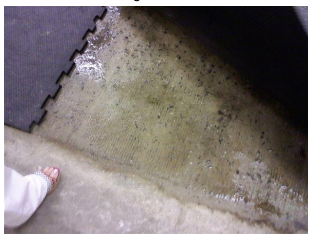
*It can be seen how in short order, StaBiotics® is starting to eat through all the bioflim buildup