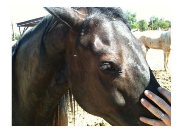
Above - Satin's Eyes-Before PureBiotics & Satin's Eyes After PureBiotics